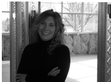
the 2nd Floor...

Looking back at some of my letters to you within the Tie that Binds newsletter it seems that each New Year brings mention of new staff, new families, new support and God's favor to a great beginning. As fall turns and winter approaches your thoughts may turn to, "What's going on at LCS this year?" And so it is again, I continue to pay tribute to all of you, our past and future, while sharing the present.