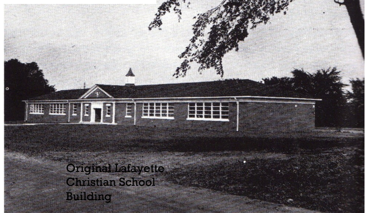
Original Lafayette Christian School Building